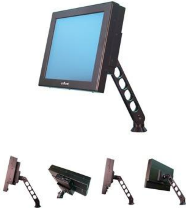
(shown with optional bench/desktop stand, click on images for larger pictures)