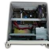
(top inside open)