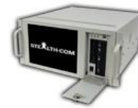
(front panel open)