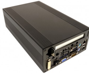
LPC-480PCIG4 Front View